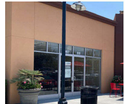
1,415 SF Space