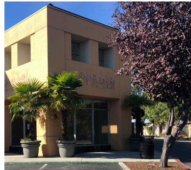
1,251 SF Space