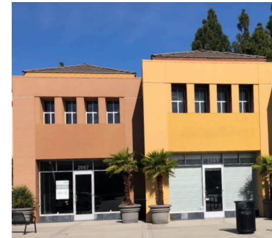
1,301 SF SPACE & 1,126 SF SPACE