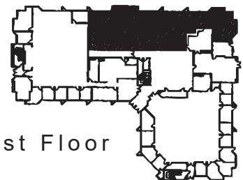
Building A, First Floor