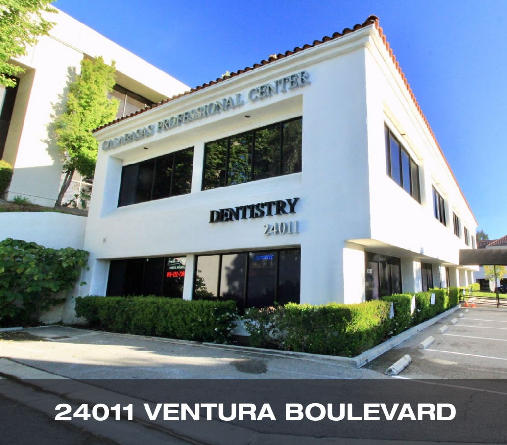
24011 VENTURA BOULEVARD