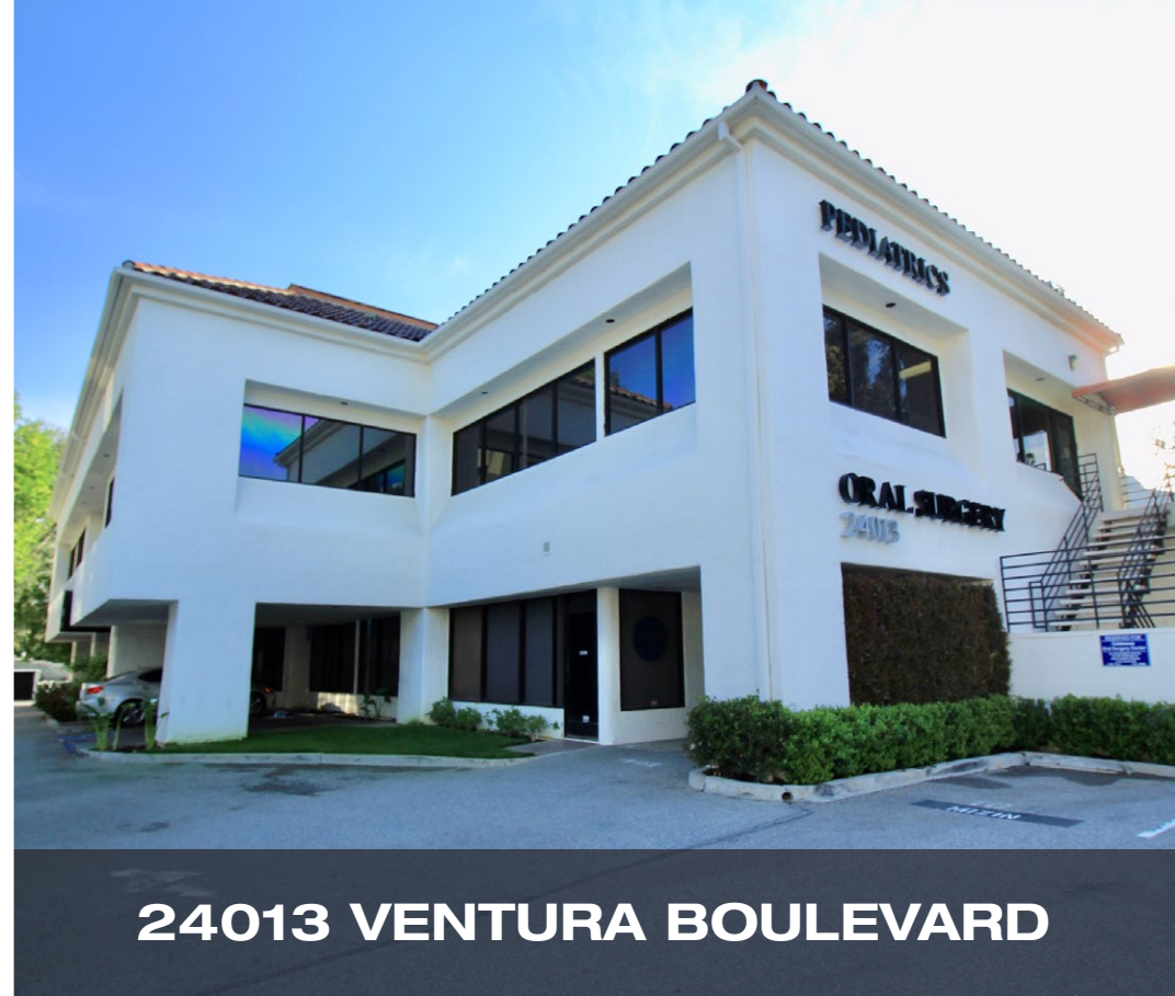
24013 VENTURA BOULEVARD