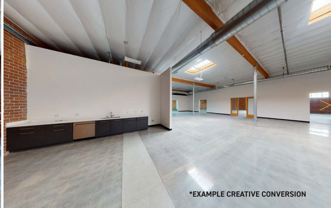
*EXAMPLE CREATIVE CONVERSION