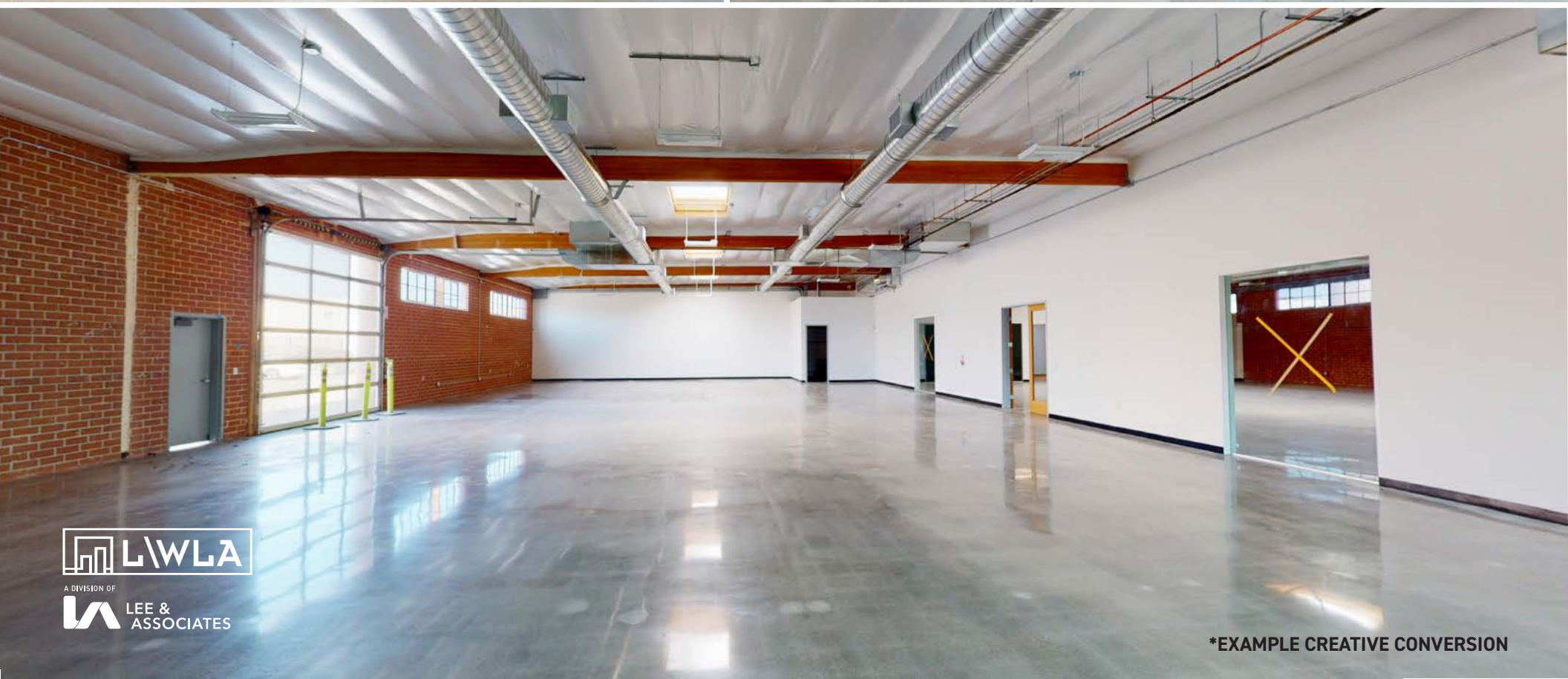
*EXAMPLE CREATIVE CONVERSION