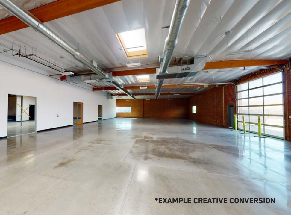
*EXAMPLE CREATIVE CONVERSION