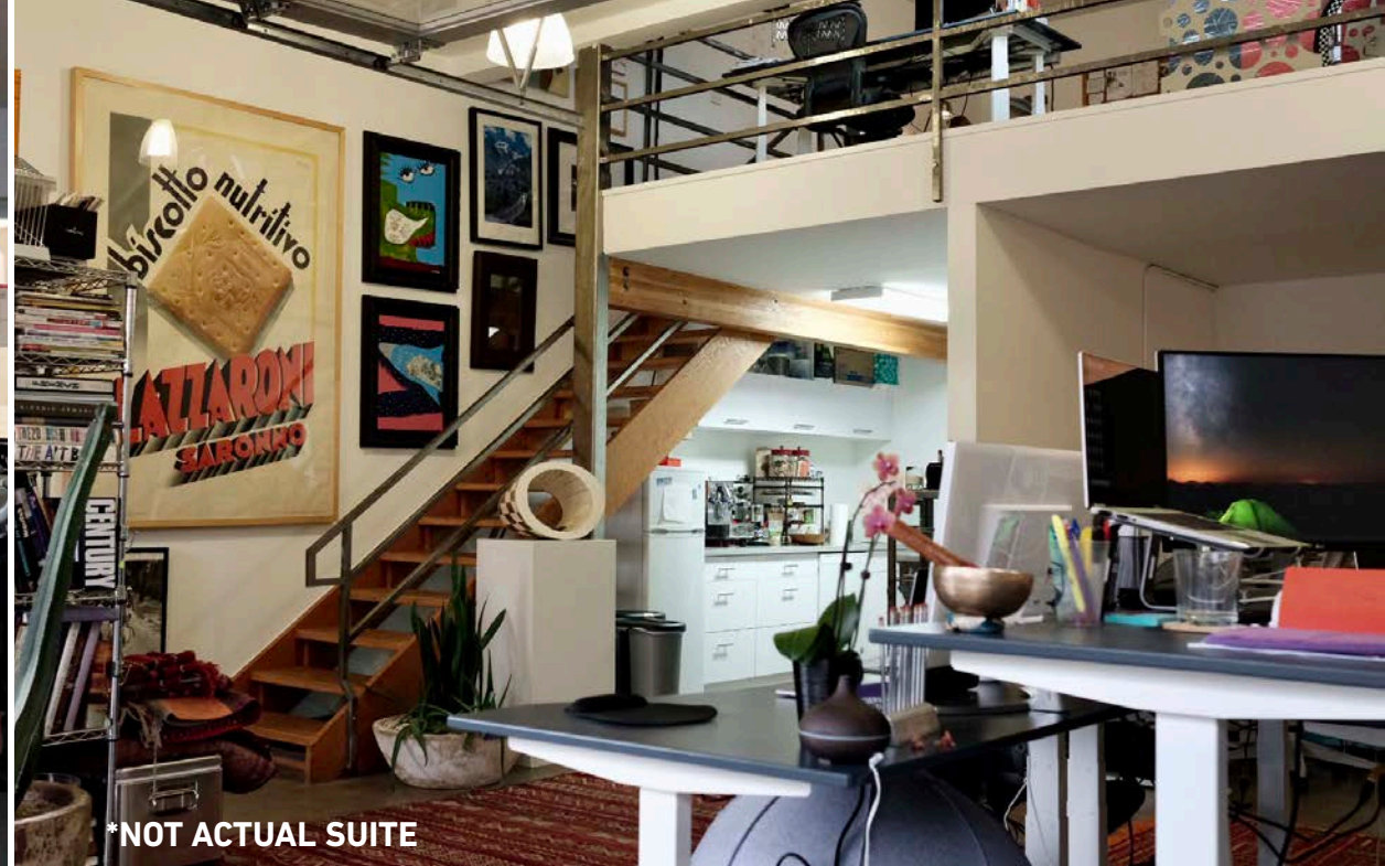
*NOT ACTUAL SUITE