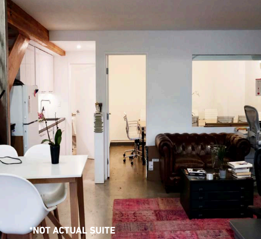
*NOT ACTUAL SUITE