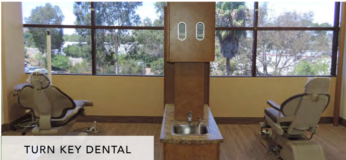
TURN KEY DENTAL