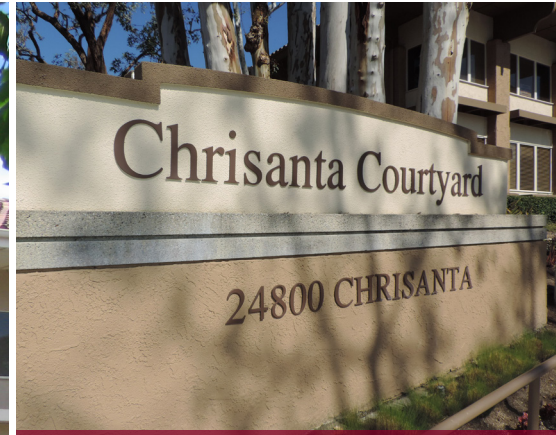
OFFICE PARK SIGNAGE