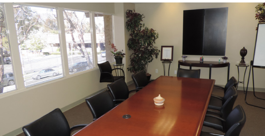
LARGE EXECUTIVE OFFICE