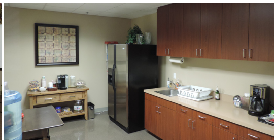
BREAK AREA WITH COFFEE & REFRESHMENTS