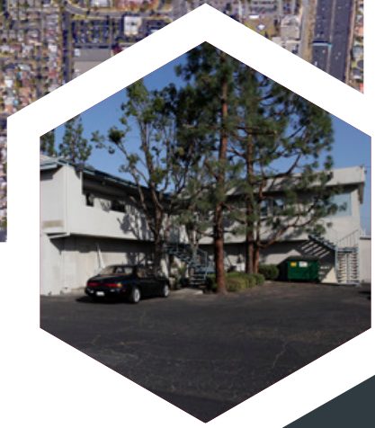
1628 E 17th St