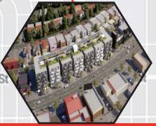
MIXED USE DEVELOPMENT