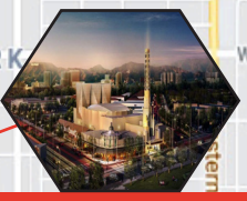
VISION THEATER RESTORATION