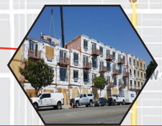
THE ARCHITECTS COLLECTIVE DEVELOPMENT