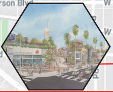
WATTS COPMANIES MIXED USE DEVELOPMENT