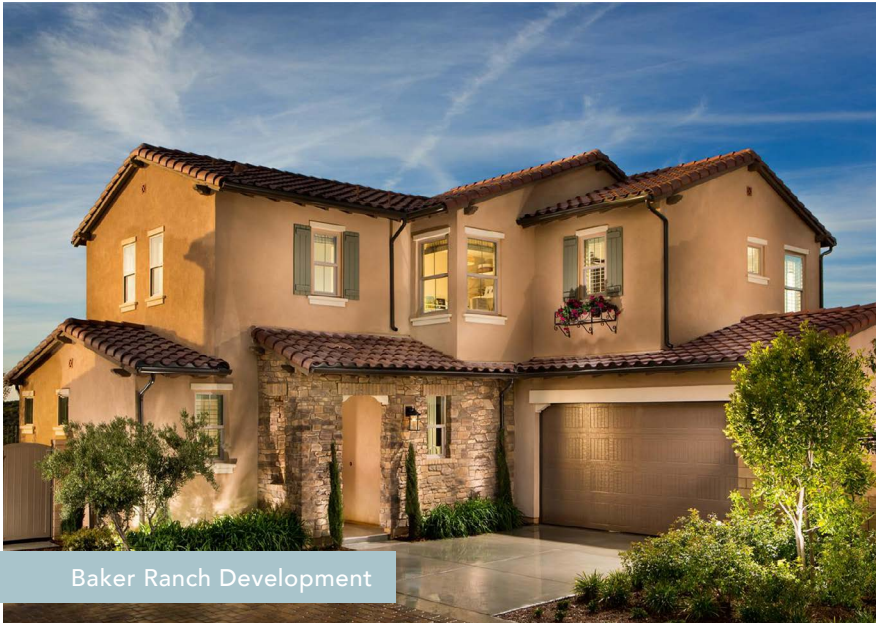
Baker Ranch Development