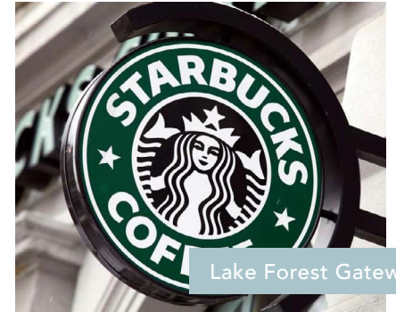
Lake Forest Gateway