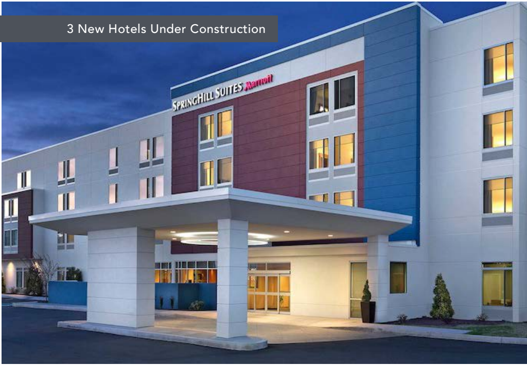
3 New Hotels Under Construction