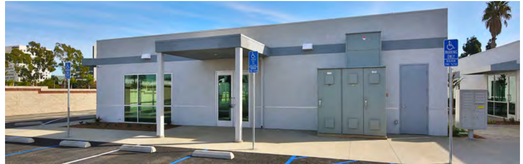
COMMON AREA COURTYARD

RENOVATIONS ARE COMPLETE. READY FOR LEASES!