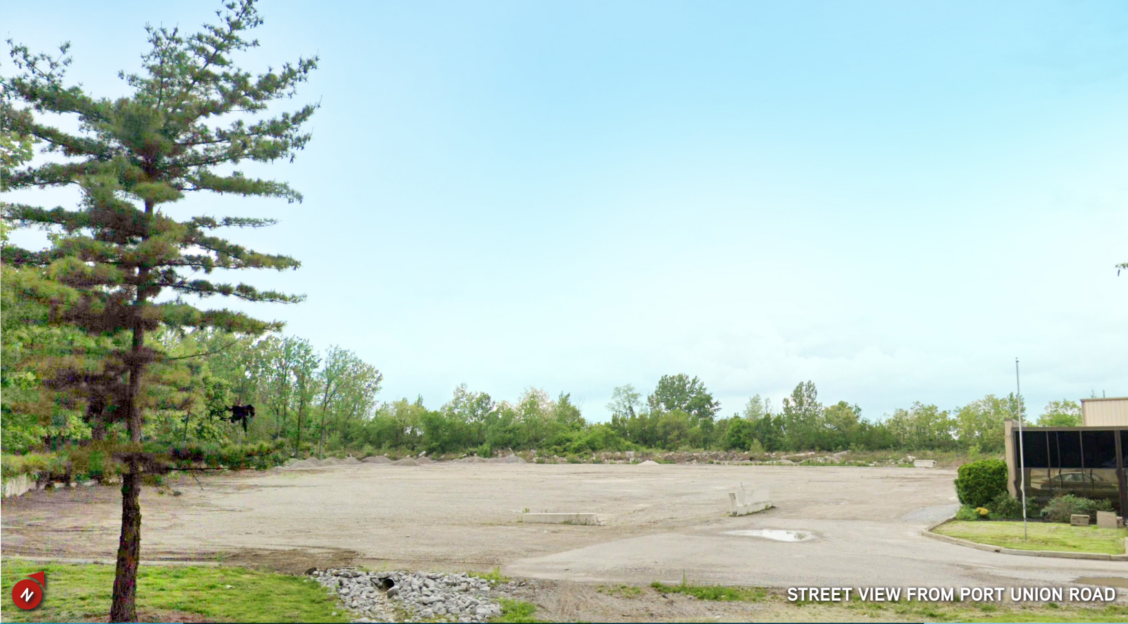
STREET VIEW FROM PORT UNION ROAD

FOR LEASE 3370 Port Union Road // Hamilton // OH