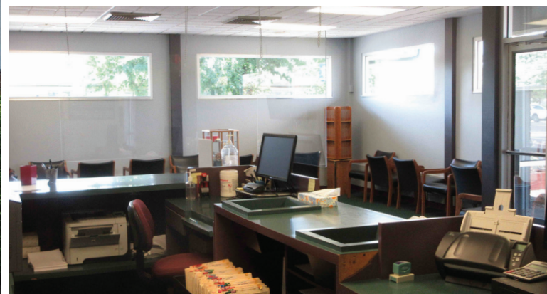
CLOCKWISE FROM TOP: Beechmont Ave signage view // Lobby/waiting area // Receptionist desk // Front building exterior