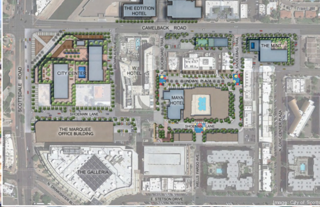
MAP OF FUTURE DEVELOPMENTS