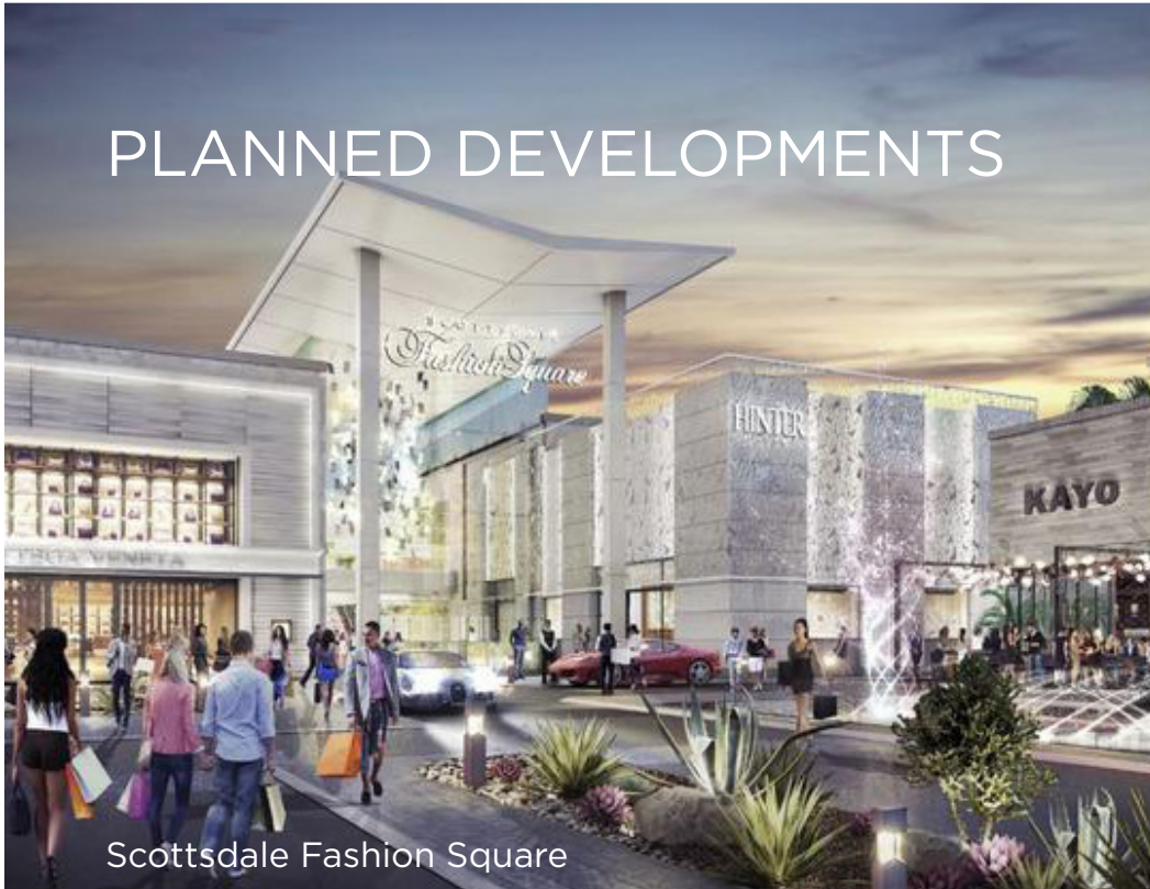
Scottsdale Fashion Square