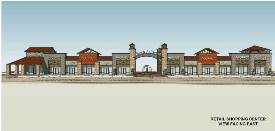
RETAIL SHOPPING CENTER VIEW FACING EAST