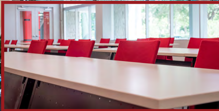
On-site conference center