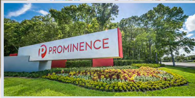
New park entrance