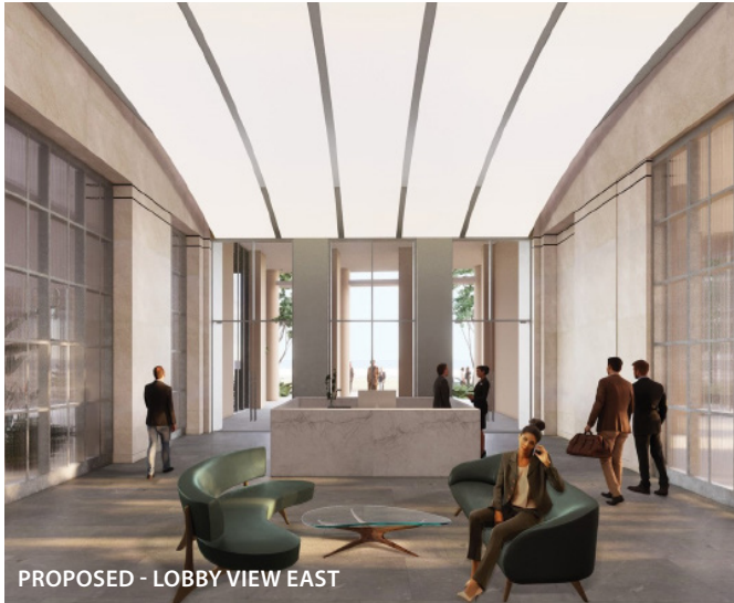
PROPOSED - LOBBY VIEW EAST