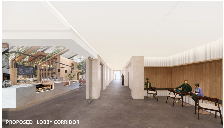
PROPOSED - LOBBY CORRIDOR