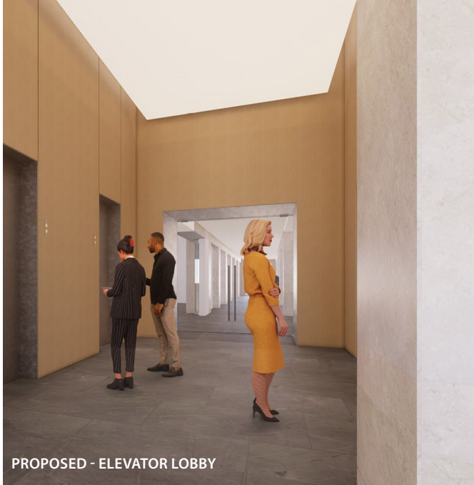
PROPOSED - ELEVATOR LOBBY