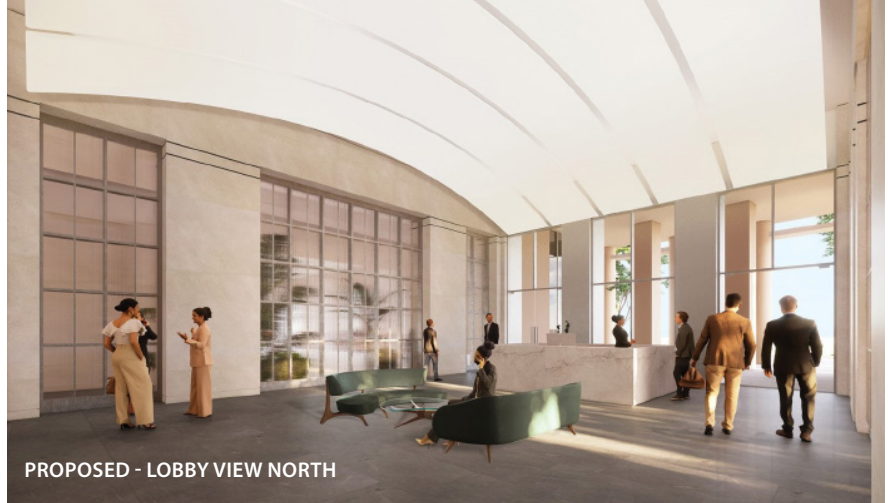
PROPOSED - LOBBY VIEW NORTH