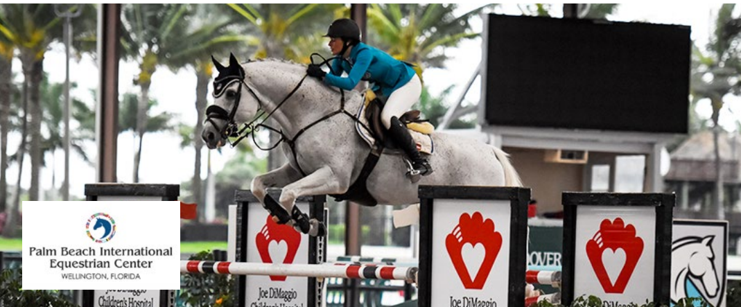
Palm Beach International Equestrian Center WELLINGTON, FLORIDA