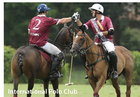
International Polo Club