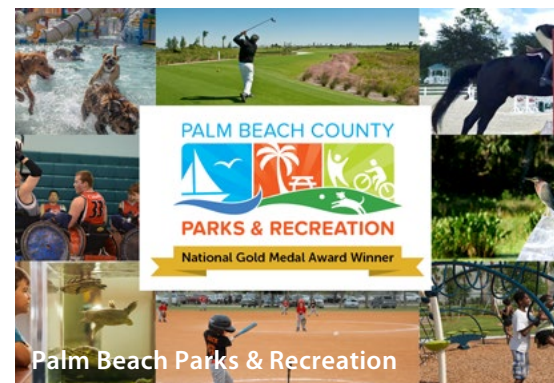
PALM BEACH COUNTY PARKS & RECREATION National Gold Medal Award Winner