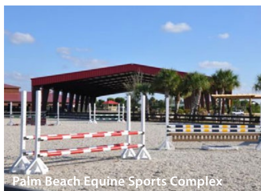
Palm Beach Equine Sports Complex