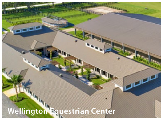
Wellington Equestrian Center