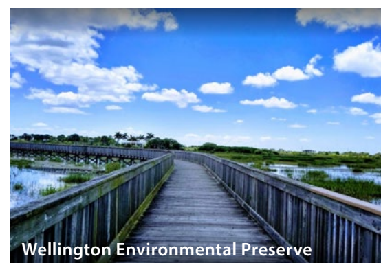
Wellington Environmental Preserve