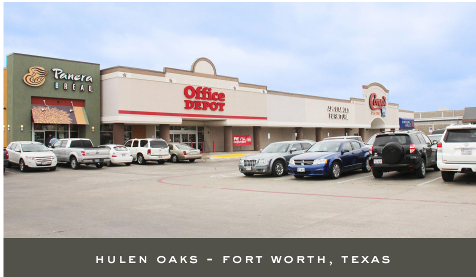
HULEN OAKS - FORT WORTH, TEXAS

4613 SOUTH HULEN STREET FORT WORTH, TEXAS 76132