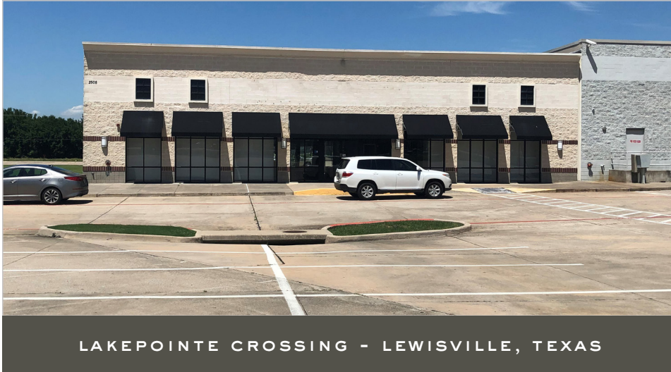
LAKEPOINTE CROSSING - LEWISVILLE, TEXAS

2508 SOUTH STEMMONS FREEWAY - LEWISVILLE, TX 75067