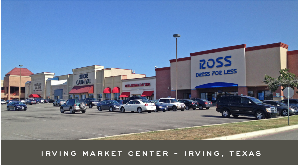
IRVING MARKET CENTER - IRVING, TEXAS

3905 - 4014 WEST AIRPORT FREEWAY IRVING, TX 75062