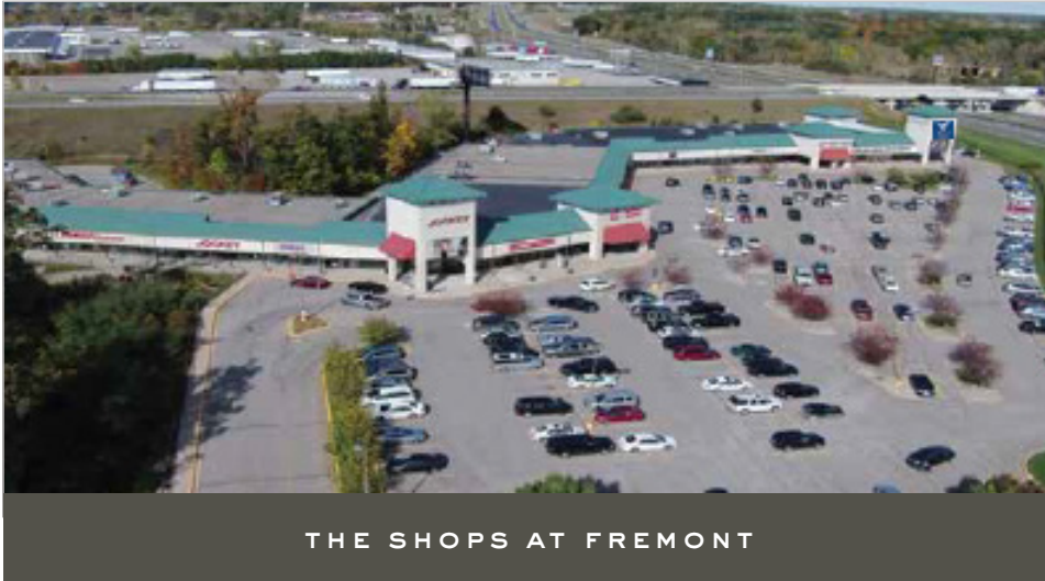
THE SHOPS AT FREMONT