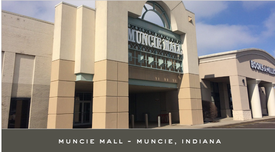
MUNCIE MALL - MUNCIE, INDIANA

3501 NORTH GRANVILLE AVENUE - MUNCIE, INDIANA 47303