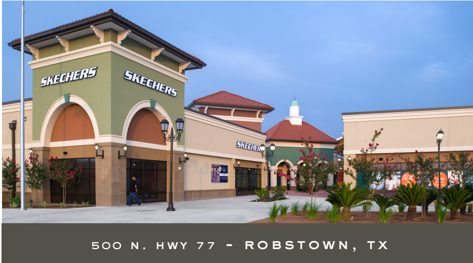
500 N. HWY 77 - ROBSTOWN, TX

500 NORTH HIGHWAY 77 - ROBSTOWN, TX 78380