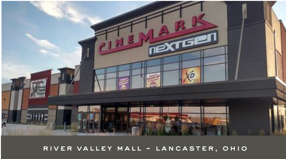
RIVER VALLEY MALL - LANCASTER, OHIO

1635 RIVER VALLEY CIR S - LANCASTER, OH 43130