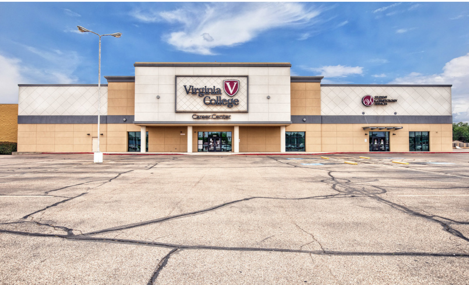
Former Virginia College Building