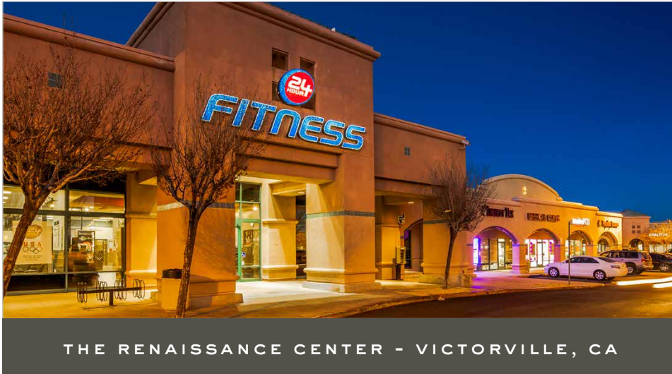
THE RENAISSANCE CENTER - VICTORVILLE, CA

16120 - 16266 BEAR VALLEY ROAD - VICTORVILLE, CA 92392