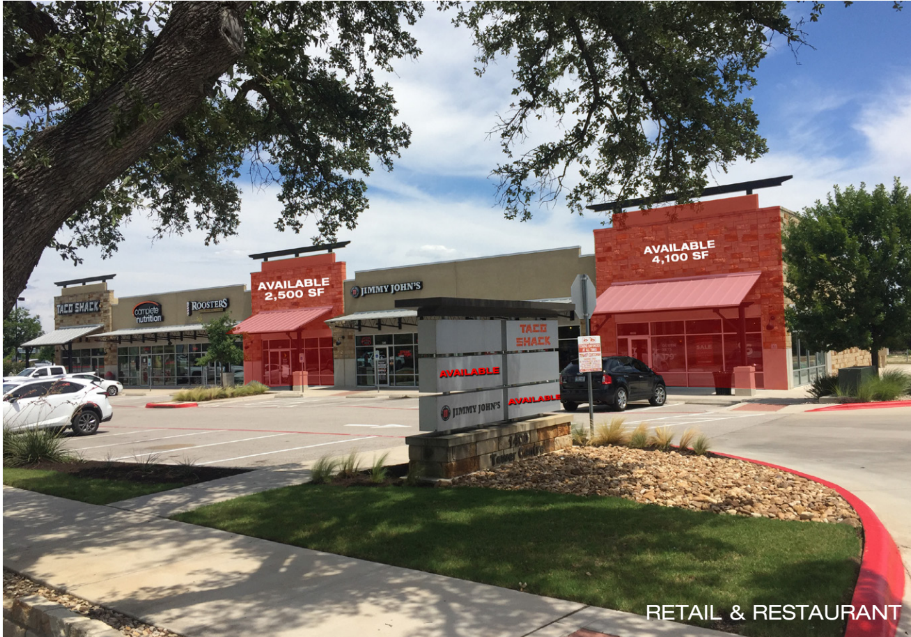
RETAIL & RESTAURANT

CEDAR PARK, TX | SEC FM 1431 & HIGHWAY 183 A | 1400 E. WHITESTONE BOULEVARD