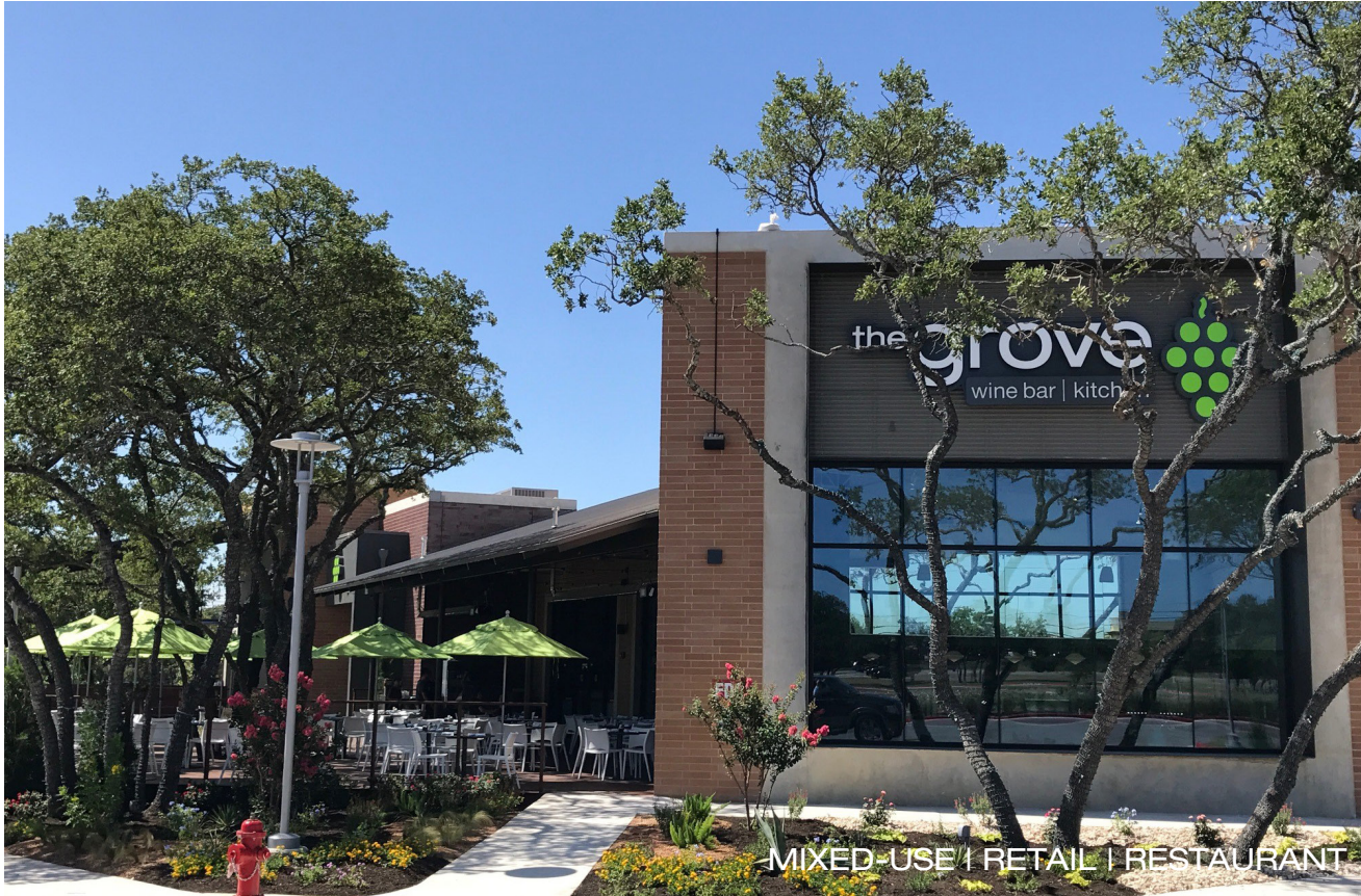
MIXED-USE | RETAIL | RESTAURANT

A 37 acre regional retail development site at the southeast corner of FM 1431 & HWY 183A. This site is located across the street from 1890 Ranch, a regional power center anchored by Super Target, Academy and Cedar Park Regional Hospital.