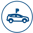
Sky Bridge System Link to Parking Garage