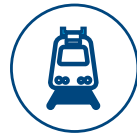
DART Rail Line Station