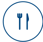
Numerous Restaurants Within Walking Distance