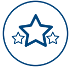
On-Site Property Management & Engineering