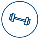
40,000 SF Health Club