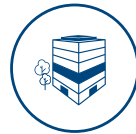
On-Site Doorman and Sundry Shop