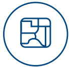
Two Blocks from Klyde Warren Park and Dallas Arts District