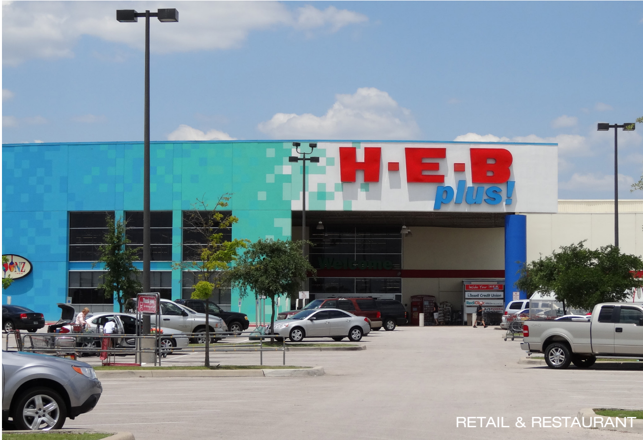
RETAIL & RESTAURANT

LEANDER, TX | NWC HWY 183 & WEST FM 2243