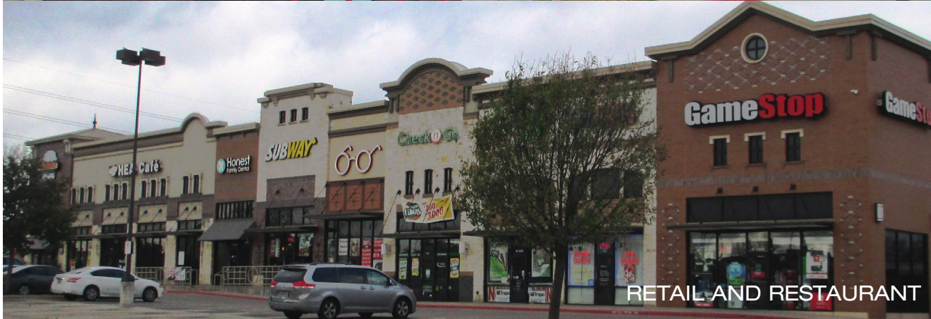
RETAIL AND RESTAURANT

Strategically located in the NWQ of IH-35 and E. Ben White Blvd. [HWY 290], the Abby at Ben White is a Walmart Supercenter shadow anchored retail center featuring a healthy mix of retailers, restaurants and service users.