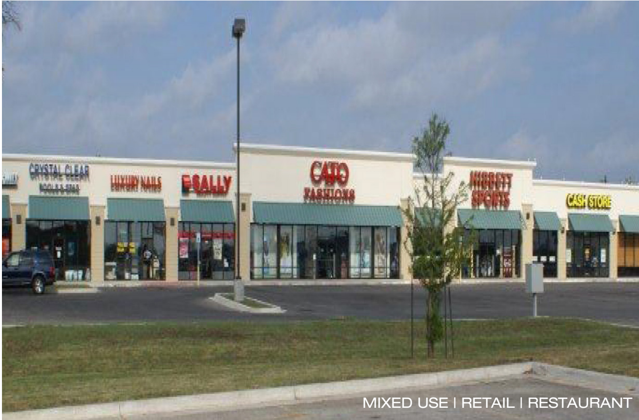
MIXED USE | RETAIL | RESTAURANT

Retail Center with a mix of national and local retailers and restaurants shadow anchored by a Wal-Mart Supercenter.