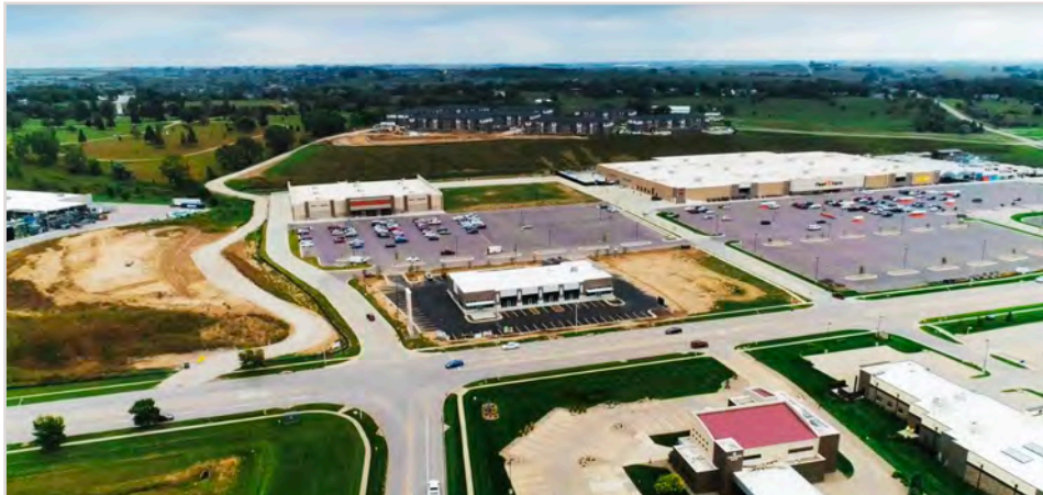
SUNNYBROOK VILLAGE - SIOUX CITY, IOWA