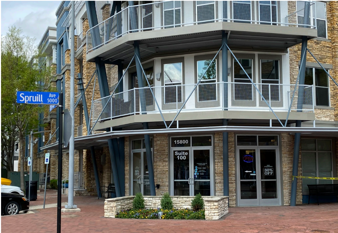
Retail opportunity at Allegro, a 392-unit apartment building.