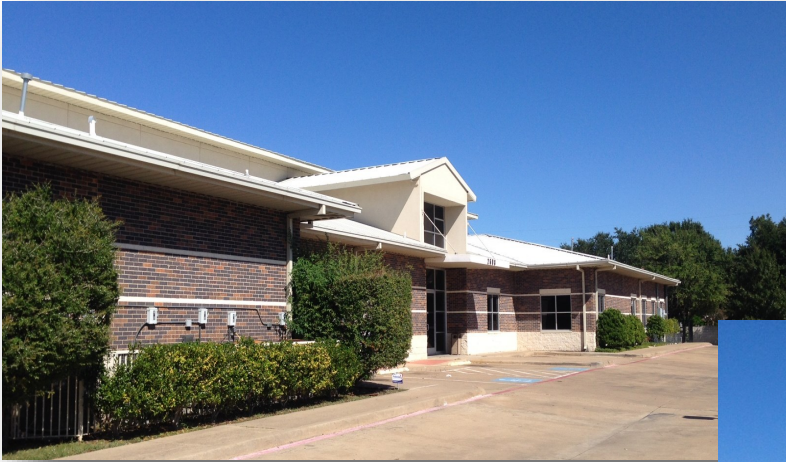
2696 N Galloway Dr