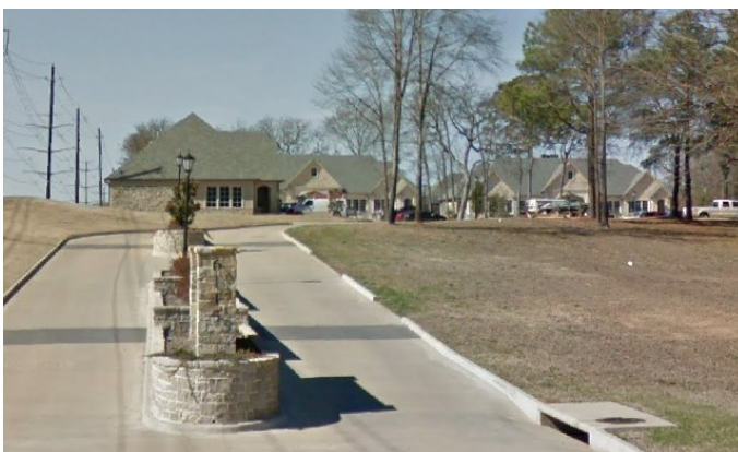
Development opposite Copeland from Subject