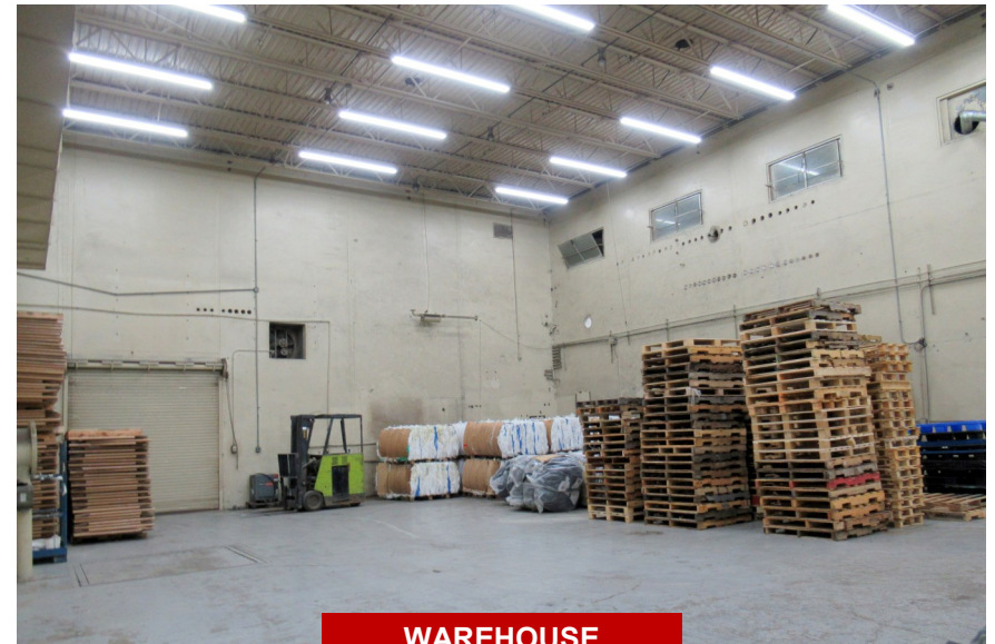
WAREHOUSE 22 Foot Stacking Height