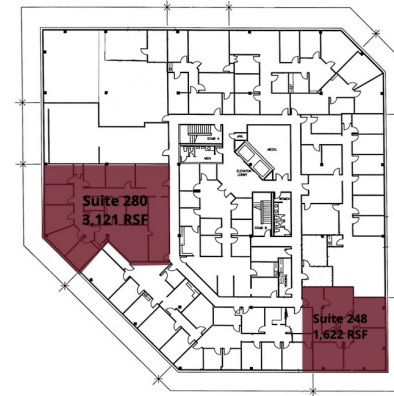
SUN PLAZA 2ND FLOOR LEASE PLAN 5656 S. STAPLES STREET CORPUS CHRISTI, TEXAS