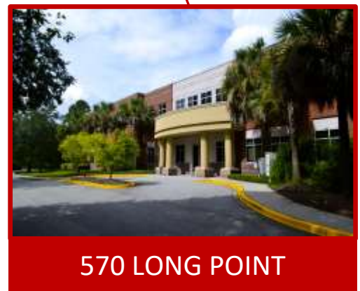
570 LONG POINT

Several spaces in move-in condition. Landlord will upfit per tenants' specifications. Generous improvement allowance available.