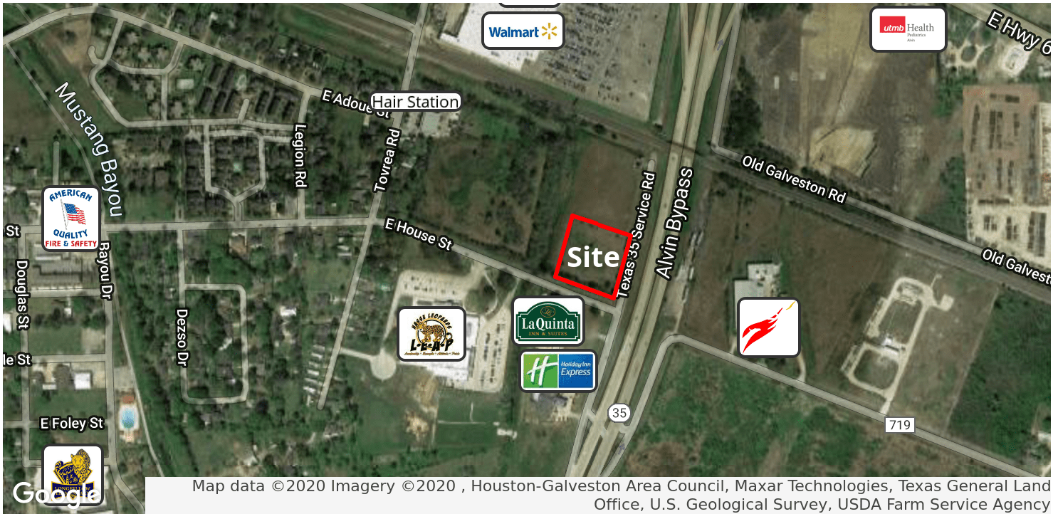
Map data ©2020 Imagery ©2020 , Houston-Galveston Area Council, Maxar Technologies, Texas General Land Office, U.S. Geological Survey, USDA Farm Service Agency

0 S GORDON STREET AT E HOUSE STREET, ALVIN, TX 77511