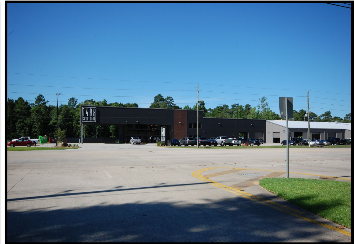
Property across FM 1488

For Additional Information Contact: Beau Harris / 936-523-0483 / 936-441-2610 / Beau@BlackLabelCommercial.com