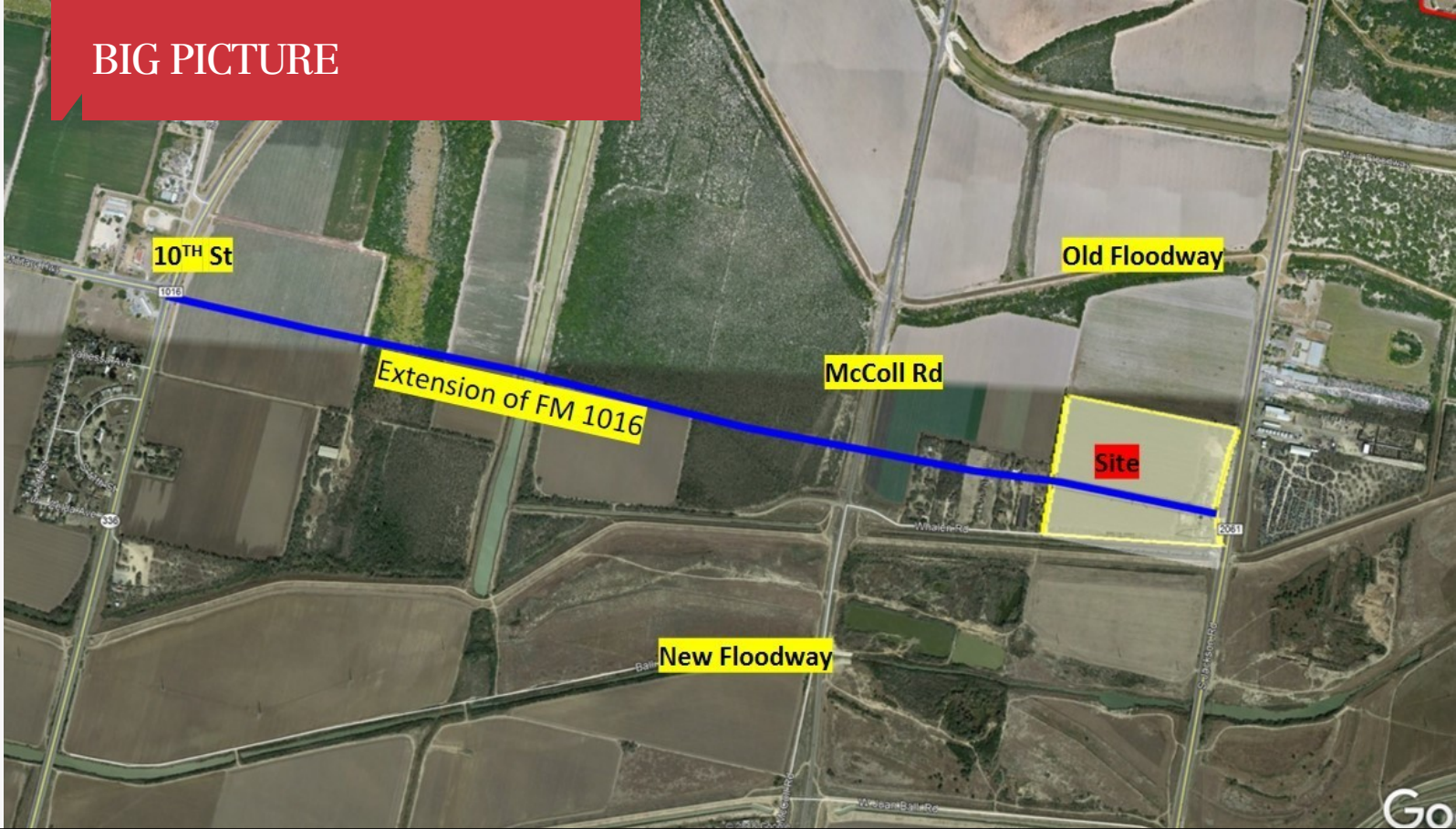
Caption 1 ROUTE OF FM 1016 EXTENSION