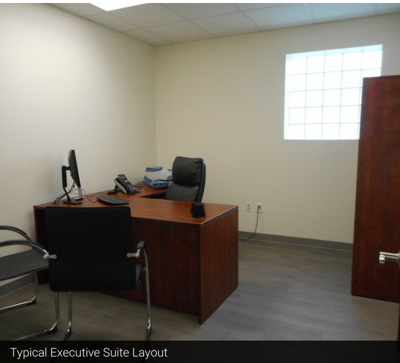
Typical Executive Suite Layout