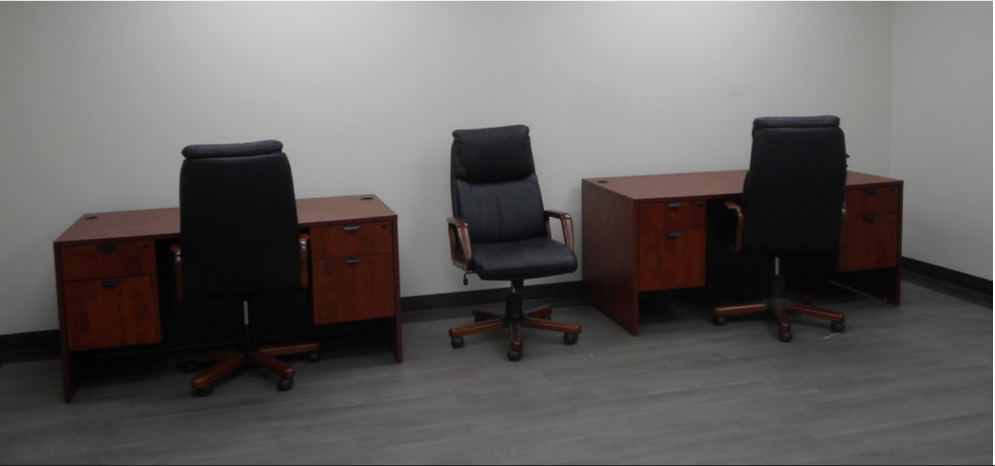
Additional Work Stations