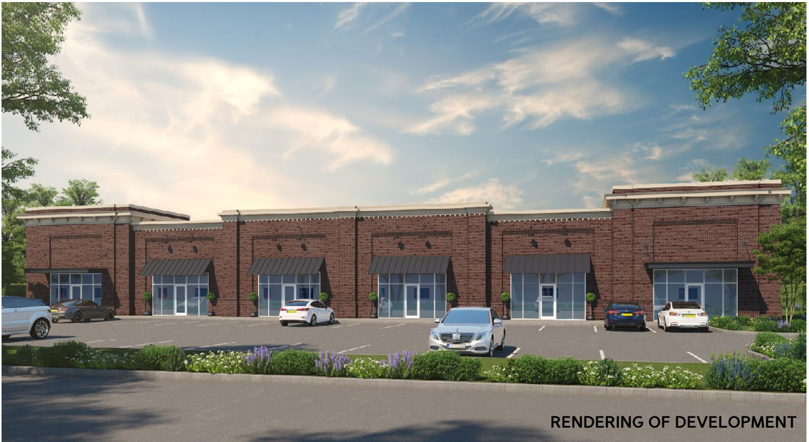
RENDERING OF DEVELOPMENT