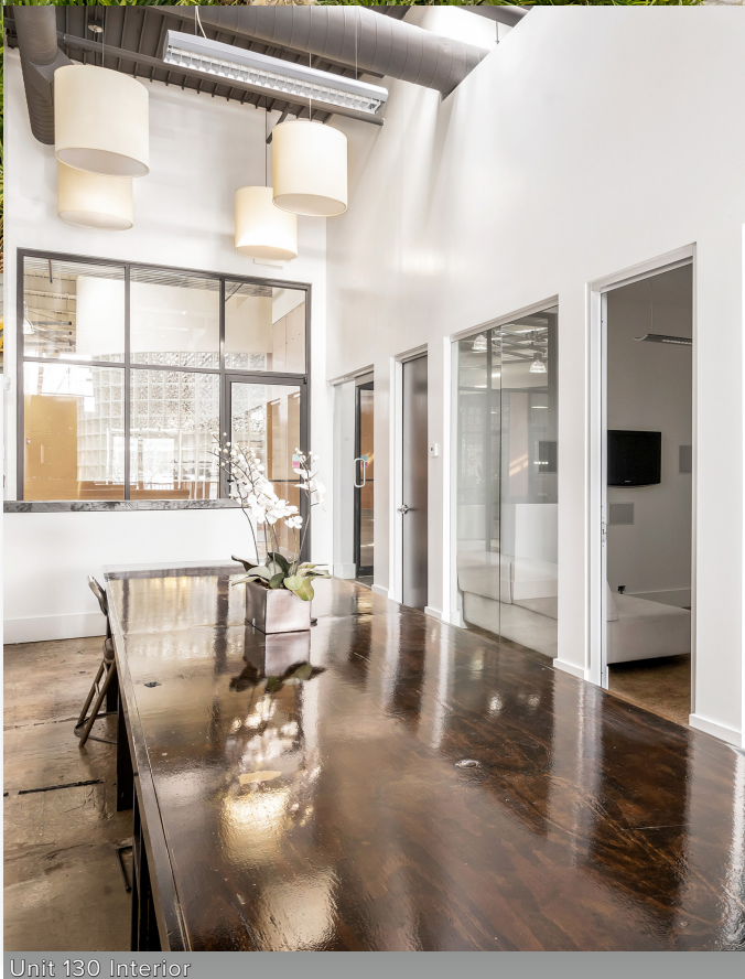
Unit 130 Interior