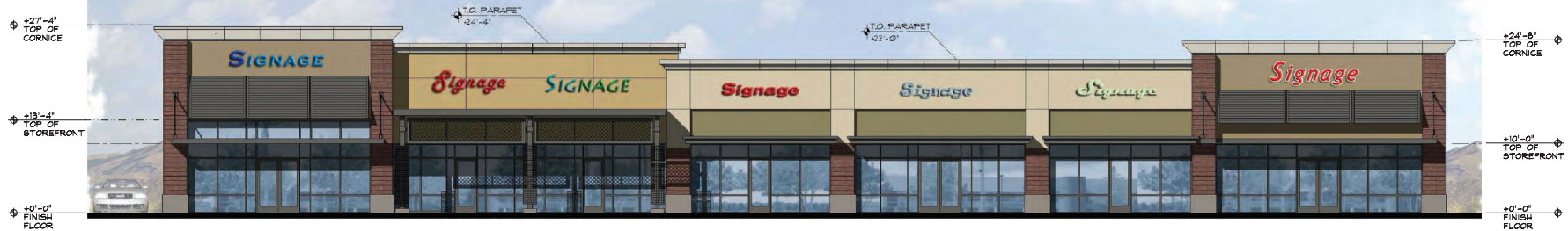
EAST ELEVATION NOT TO SCALE