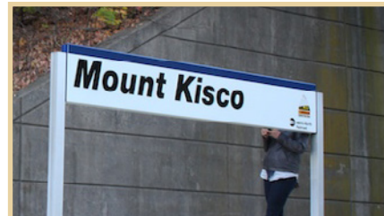
METRO NORTH TRAIN STATION