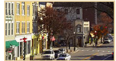
DOWNTOWN MT. KISCO