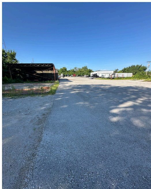
Front Lot Parking Area