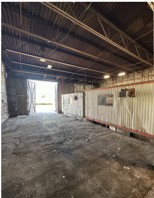
6,000 SF Building Interior