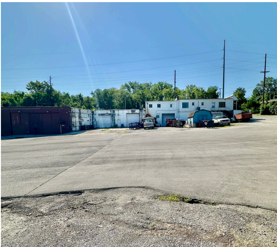
Back of Front Building