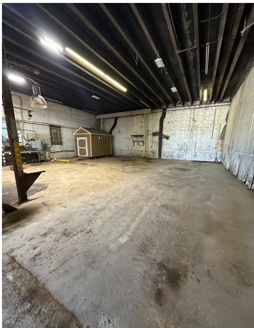
6,000 SF Building Interior