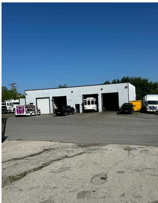
4,000 SF Building