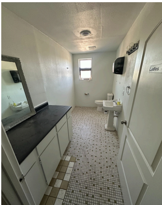
Interior Office Bathroom