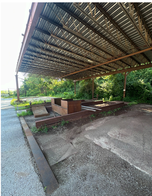
Covered 2,000 SF