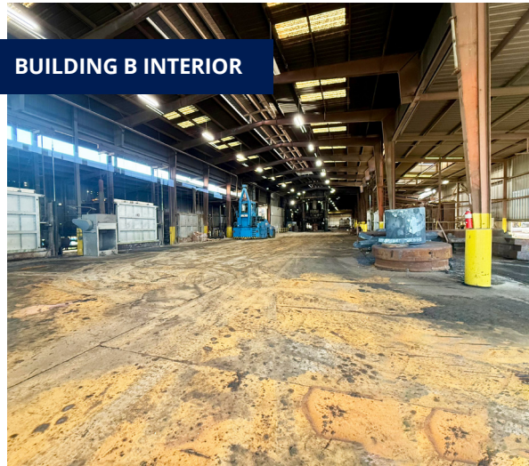
BUILDING B INTERIOR