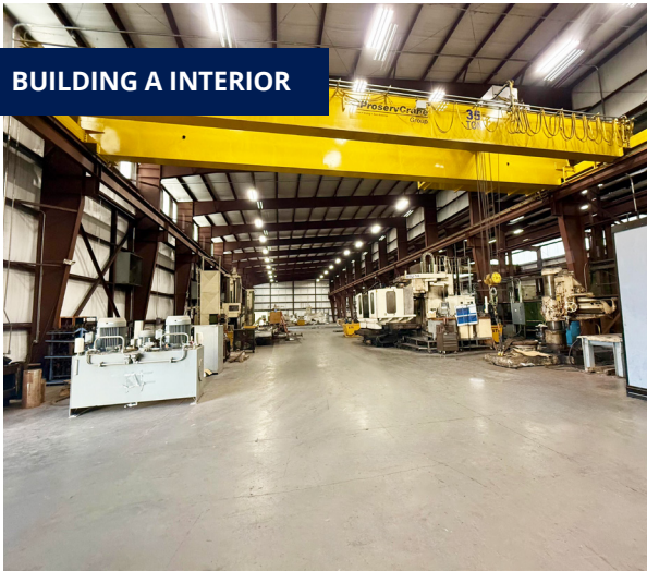
BUILDING A INTERIOR