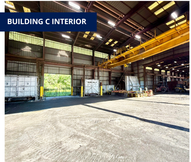
BUILDING C INTERIOR