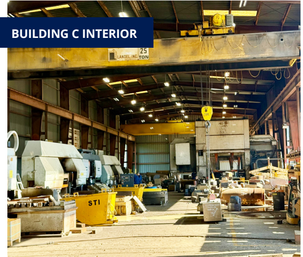
BUILDING C INTERIOR