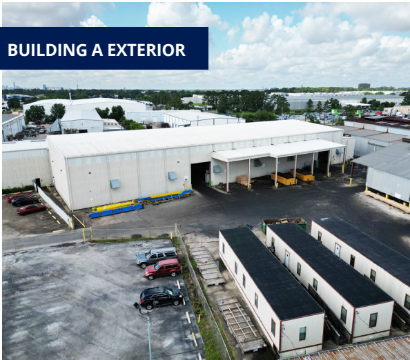
BUILDING A EXTERIOR